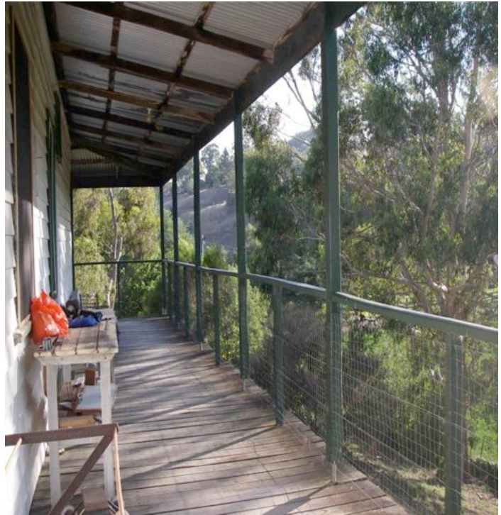
The soon to be covered in gear, Homeleigh Back Verandah